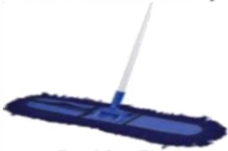
Dry Mop Blue [18" & 24"] RC090