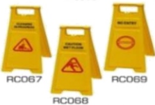
RC067 RC068 RC069