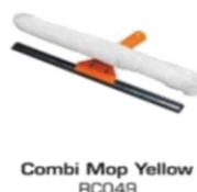
Combi Mop Yellow RC049