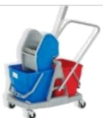
40 Ltr Double Mop Wringer Trolley Plastic Frame RC005

We use professional cleaning tools, where ever manual cleaning or maintenance is required. All chemicals too will be completely biodegradable in nature and of International Standard.