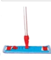
Micro Fiber Mop RC086