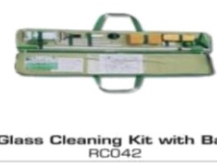
Glass Cleaning Kit with Bag RC042