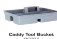
Caddy Tool Bucket RC001