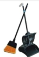
Plastic Shovel RC066