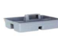
Caddy Tool Bucket RC001