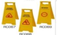
RC067 RC068 RC069 RC068