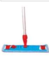
Micro Fiber Mop RC086