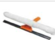
Combi Mop Yellow RC049