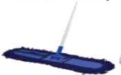
Dry Mop Blue (18" & 24") RC090