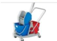
40 Ltr Double Mop Wringer Trolley Plastic Frame RC005

We use professional cleaning tools, where ever manual cleaning or maintenance is required. All chemicals too will be completely biodegradable in nature and of International Standard.