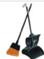
Plastic Shovel RC066